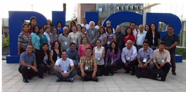
Participants of CANP 5

This influenced the name CEMAS chosen for the network, and indeed CEMAS expects other countries of South America to join so that together they may build a solid network. The CANP5 has received important support from the Institutions of participant countries and CIAEM, but most significantly from the PUCP and the Ministry of Education of Perú that honored the program by sending high-level representatives to the inauguration and closing ceremonies.