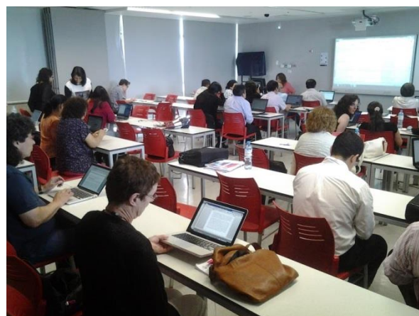
Session at CANP 5

This influenced the name CEMAS chosen for the network, and indeed CEMAS expects other countries of South America to join so that together they may build a solid network. The CANP5 has received important support from the Institutions of participant countries and CIAEM, but most significantly from the PUCP and the Ministry of Education of Perú that honored the program by sending high-level representatives to the inauguration and closing ceremonies.